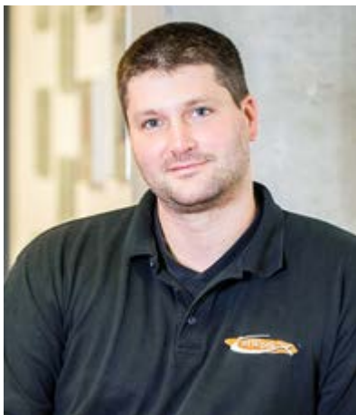
Managing Director of catWorkX GmbH & Head of Atlassian OSS